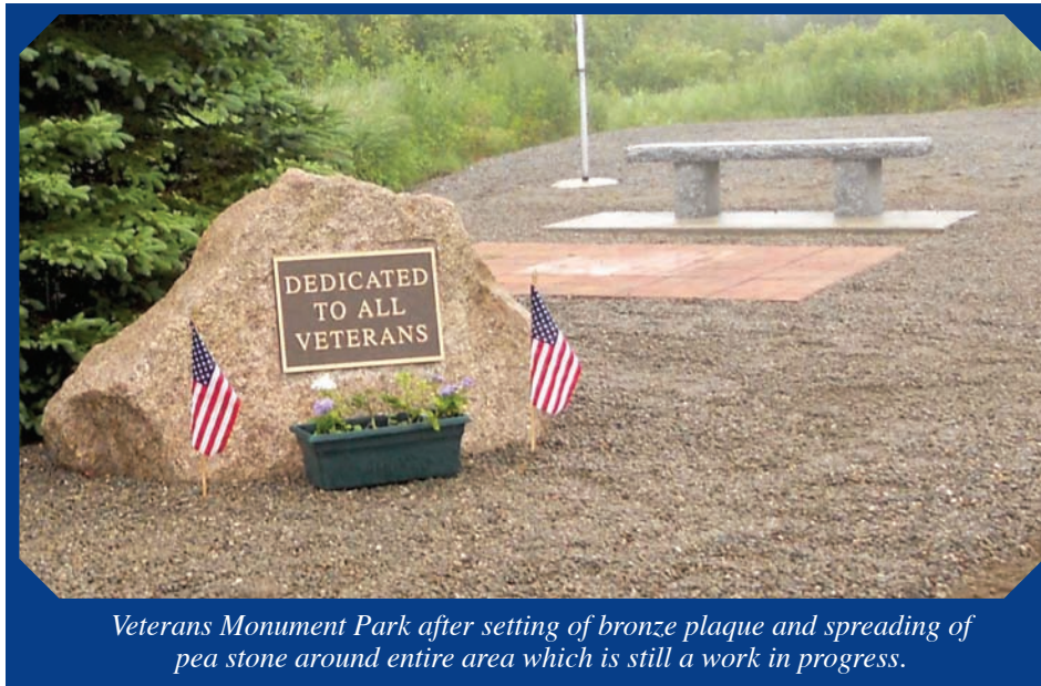
Veterans Monument Park after setting of bronze plaque and spreading of pea stone around entire area which is still a work in progress.