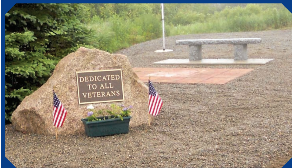
Veterans Monument Park after setting of bronze plaque and spreading of pea stone around entire area which is still a work in progress.